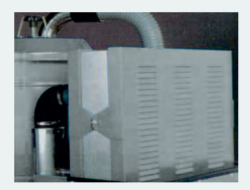
Absolute exhaust air filter