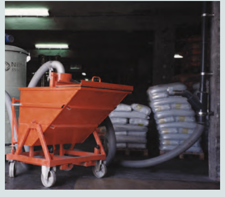
Recovery of high quantity of heavy materials