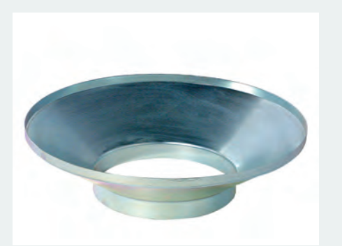
Removable cyclone that protects the primary filter from becoming in direct contact with incoming liquids or sharp objects