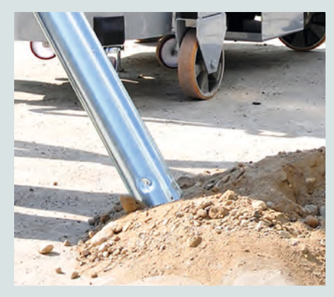
Recovery of waste