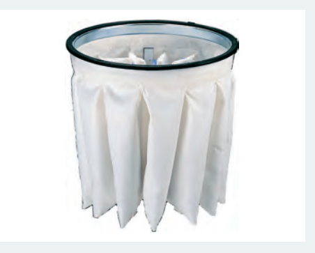
Standard star filter