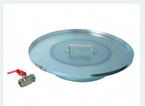
Grill and valve for separating solids from liquids inside the container