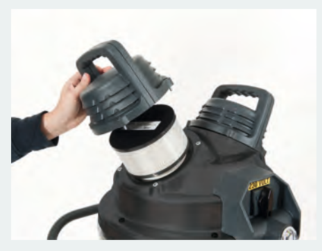
Absolute filtration for the cooling air