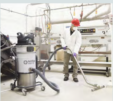
Cleaning of the production area to secure the Practical container release system highest level of hygiene