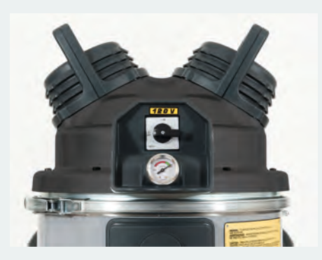
Vacuometer to monitor constantly the vacuum cleaner performances