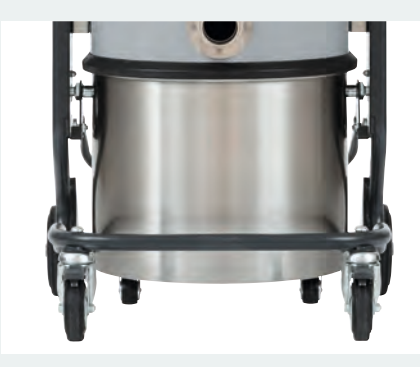
Stainless steel 37L container