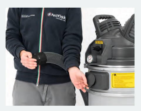
PullClean filter cleaning system: close the inlet and pull the flap rapidly and several times